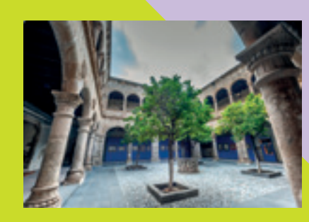
Orange Tree Cloister Decorated in a

Visitors can tour the first floor of the building, which includes the pilgrim's gate, gatehouse, kitchen, refectory, anterefectory, sala de profundis, and large and small cloisters. On the upper floor, you can visit spaces such as the cells, west gallery, large and small cloisters, chapter hall, and open chapel. It is an architectural marvel of the 16<sup>th</sup> century.